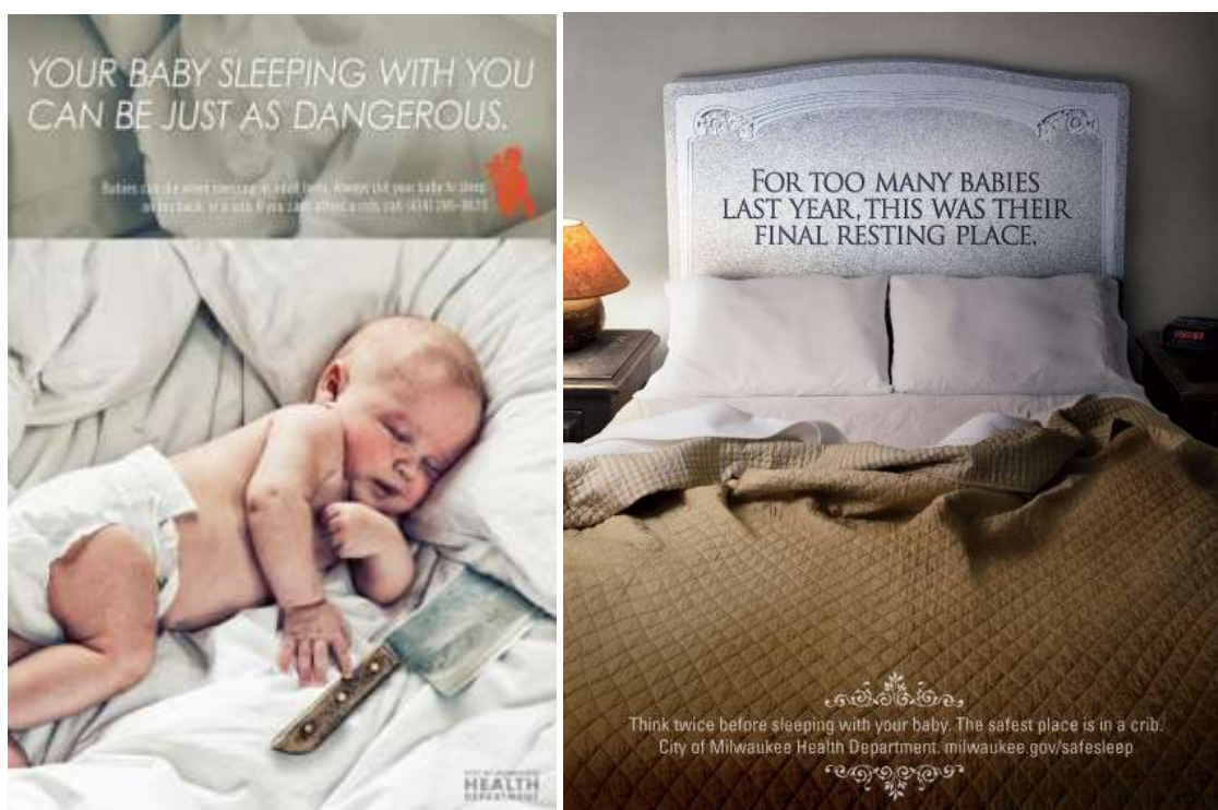
Figure 3. Images from the Milwaukee campaign against SIDS.