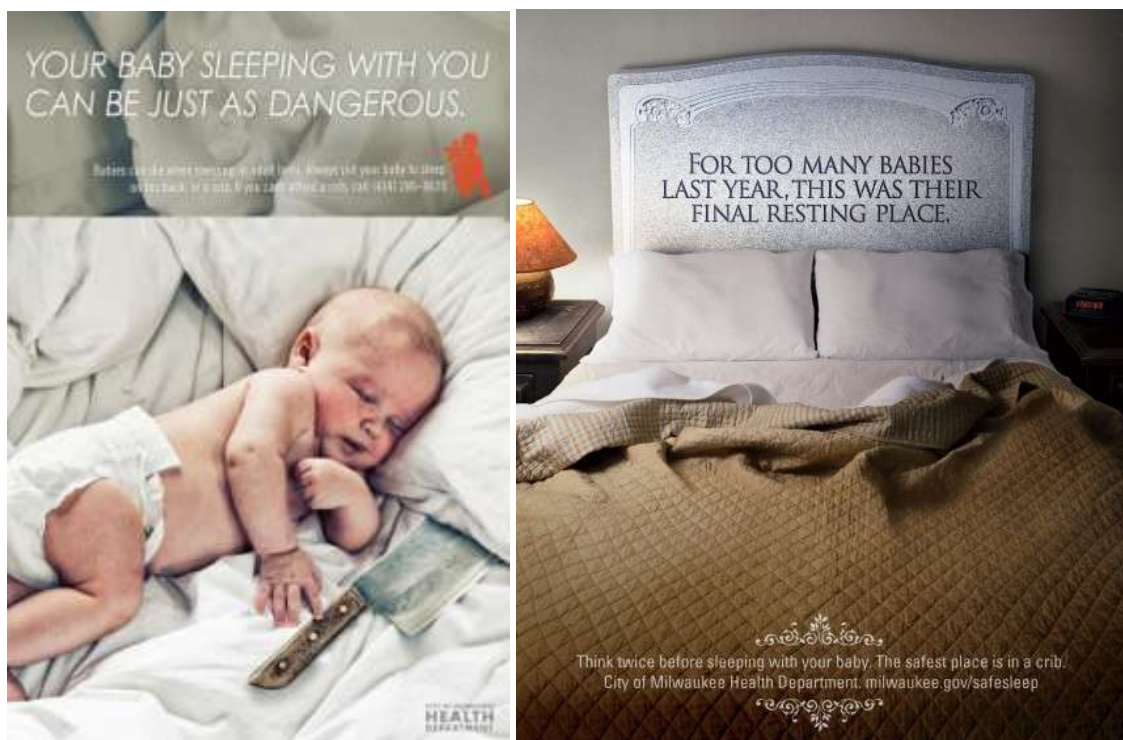
Figure 3. Images from the Milwaukee campaign against SIDS.